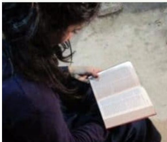
Christian child in Garbage City reads her Bible.

Child Sponsorships: CFI’s generous sponsors provided monthly support for 46 children in Egypt, which gave each family food and allowed funds to visit a doctor and buy medicine when a family member was ill. During the back-to-school season, we provided school supplies, and a printer for the children to print their school lessons and improve their studying.