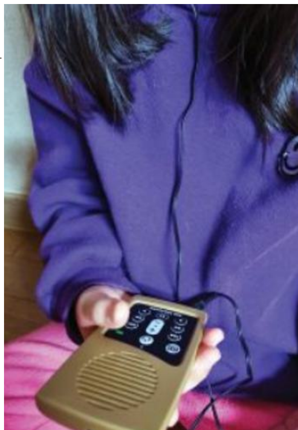
Audio Bibles for North Korean defectors in CFI's shelter

Christian Freedom International equipped our partners to get shortwave radios to 300 women living in rural towns who are predominantly North Korean trafficked victims sold to Chinese men as “wives.” These radios give the women and their children the ability to listen to Christian broadcasts such as Free North Korea Radio.