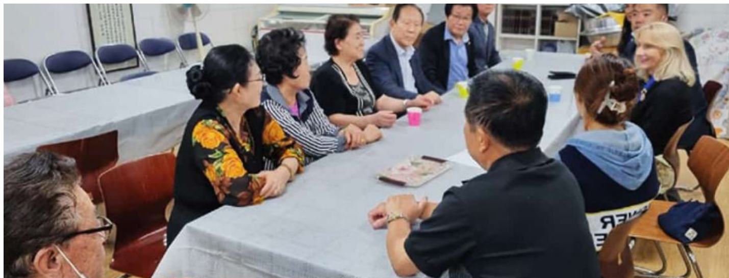
CFI meets with North Koreans who escaped.

South Korea: With CFI's assistance, one of our partners, an escapee from North Korea, provides shelters in China and care for defectors who arrive in South Korea. Elderly folks come several times a week to their center for food, other aid, and worship services.