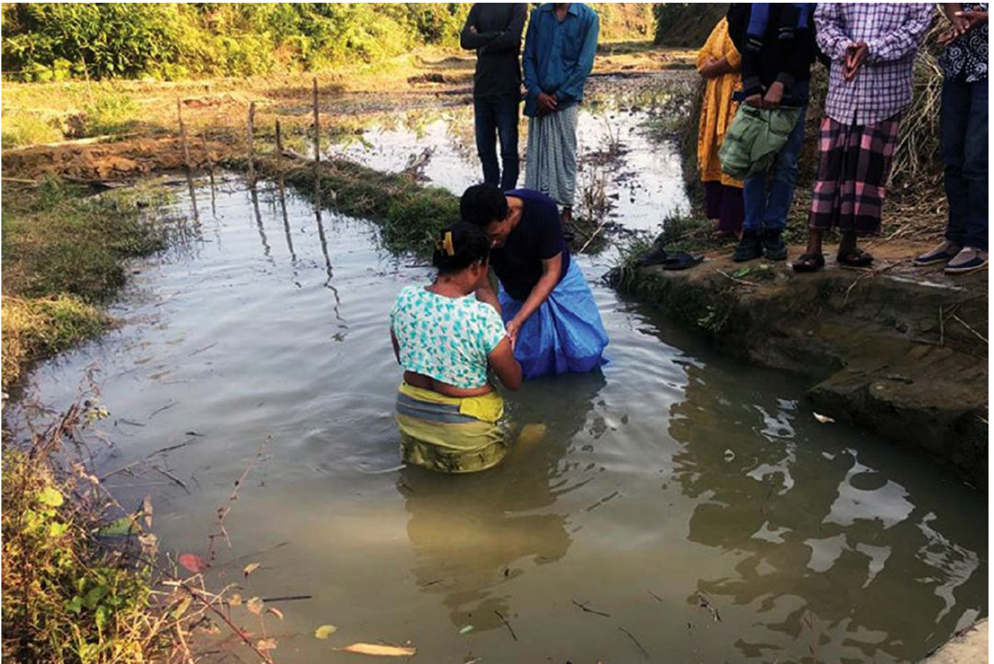
Secret baptism in a restricted country

† Sustaining and growing the local church.