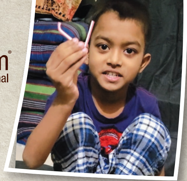
Christian child in a shelter shows his toy. His family is hiding from Islamist extremists.