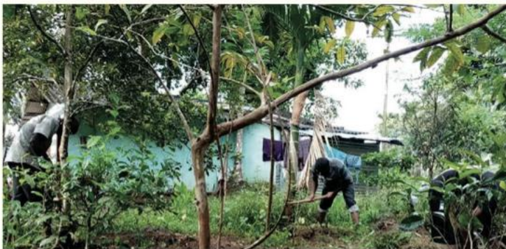
Christians plant seedlings provided by Christian Freedom International.