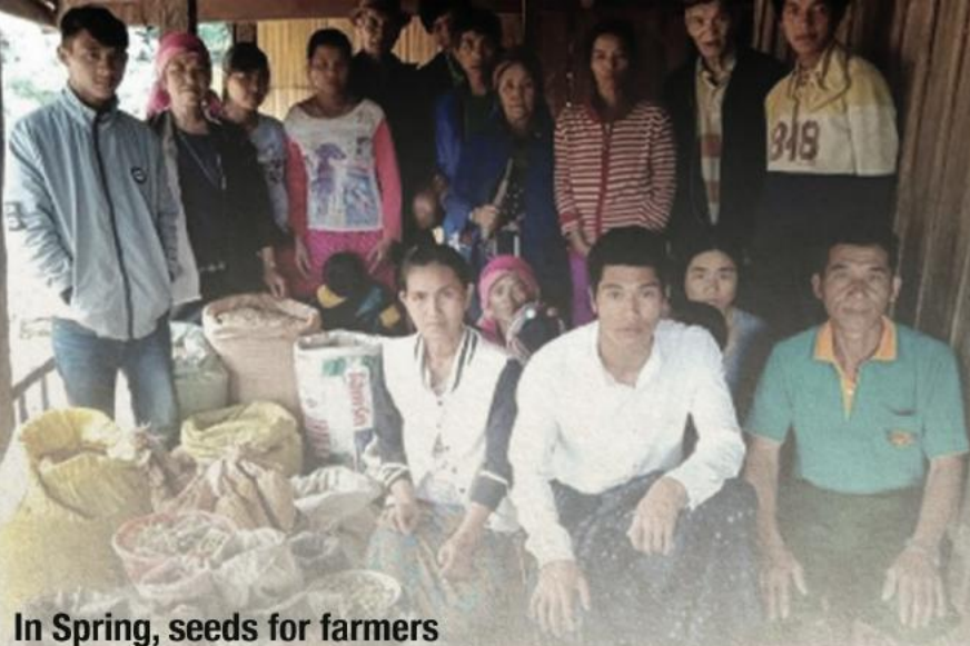
In Spring, seeds for farmers