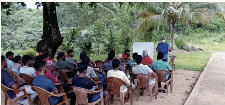
Churches hosts trainings on growing food.