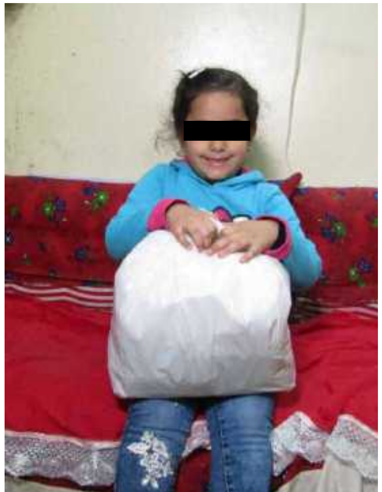
Sponsors provide Christian children with food and school items.

“I thank God so much for providing me with the wedding funds through CFI ministry. I really thank CFI ministry so much for helping me, bringing a smile to my face and the faces of my family. I ask you pray for my new married life and for all the members of my family. Thank you again for everything, May God bless you all.”