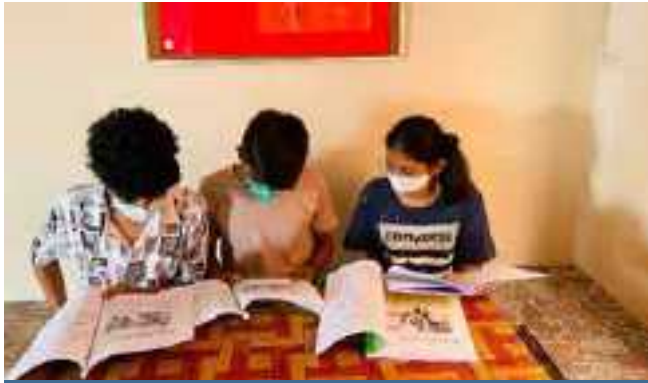
"Literary Corner" at CFI's school for Pakistani Christian refugees

The global pandemic left an indelible impression upon each area of Christian Freedom International's ministry to Pakistani Christian refugees in Bangkok. Yet by God's grace the ministries of assisting Christian refugees with a school, church, and family sponsorships goes on unabated.