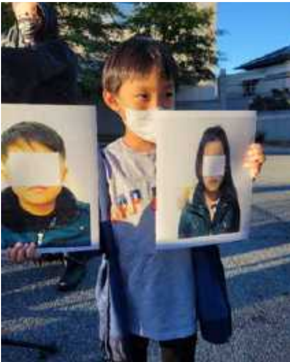
Protest at Chinese embassy to urge the release of Christian families who escaped North Korea.