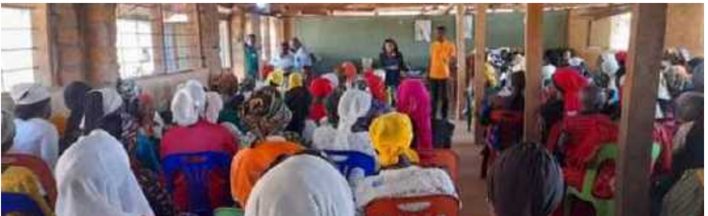
Christian widows in Nigeria were trained and equipped to start small businesses.

They were also given seed funding to begin and expand their small businesses.