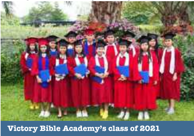
Victory Bible Academy's class of 2021

Each year Victory Bible Academy adjusts to meet the needs of persecuted Christians in the region. Thanks to your prayers and support, Victory is ready to meet the unexpected