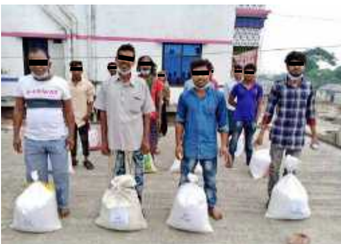
Ofentimes converts will not get hired due to their faith. CFI provided emergency aid during Covid.

Child Sponsorship: 29 children were provided tuition fees, educational accessories, food, and medicines. Without Christian Freedom International's child sponsorships, these children of Christian families would likely have to drop out of school.