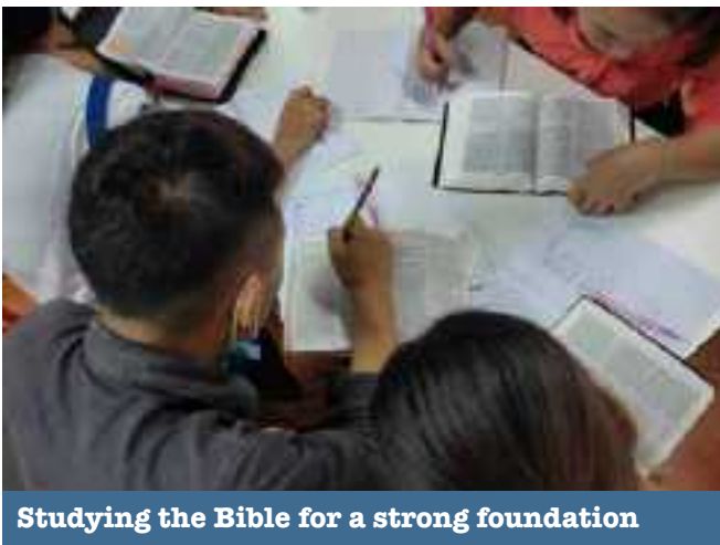
Studying the Bible for a strong foundation

"I thank CFI for supporting our school. Thank you for loving us. I wish God will bless you and watch over you."