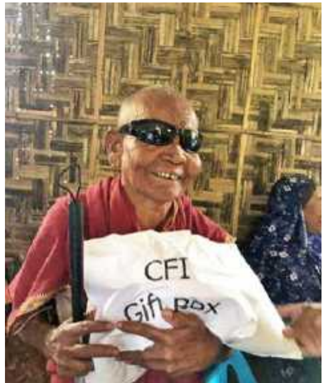
Christians give food and gifts to blind persons on White Stick Safety Day.

In another area, a young married couple was attacked by neighbors. The wife came from a Muslim family and chose to become a Christian. They were able to escape from death by an angry mob and hid at Christian Freedom International's shelter.