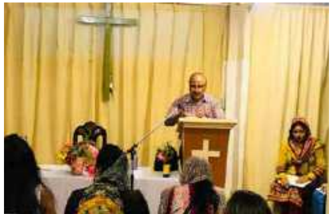
Sunday service at Church of Glory in Bangkok

Sponsorships: Family sponsorships brought hope and help for around 130 Pakistani Christian refugees who fled persecution in their country. Each month they received basic food staples such as rice, cooking oil, sugar, salt, along with toiletries including soap, toothpaste, dish soap and laundry detergent. The program is an opportunity for Christian Freedom International's co-worker, a pastor, to regularly meet and minister to the families.