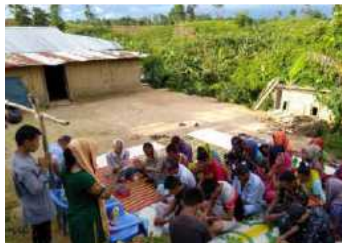
Christian converts who survived violent attacks on their families were given shelter, food, and spiritual encouragement.