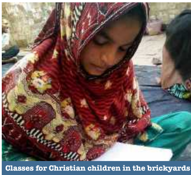
Classes for Christian children in the brickyards