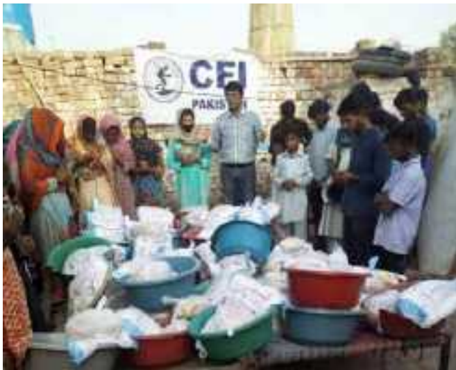
Families in brickyards receive food each month through CFI's child sponsorships.

Twice a month, 37 children between the ages of 6 to 18 are taught Bible, math, Urdu.