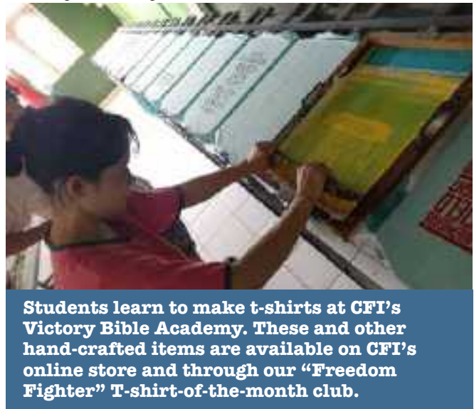
Students learn to make t-shirts at CFI's Victory Bible Academy. These and other hand-crafted items are available on CFI's online store and through our "Freedom Fighter" T-shirt-of-the-month club.