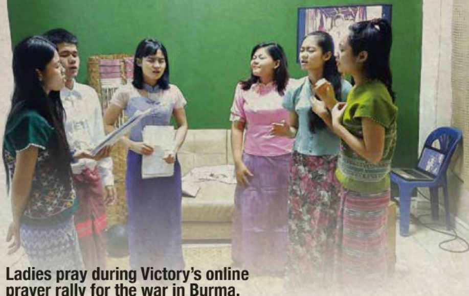
Ladies pray during Victory's online prayer rally for the war in Burma.

Christian Freedom International's school trains persecuted Christians to be Christian leaders with the heart and skills to serve others. Victory Bible Academy's Class of 2022 conquered the two-year intensive program during the Covid pandemic and war in Burma.