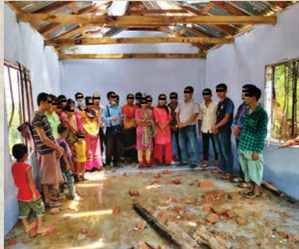
Christians pray before the second attack.

They did all of these bad things to us for being Christians. Before leaving the house, they told us to