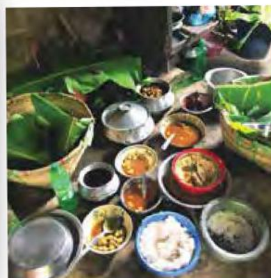
A feast of Chakma food