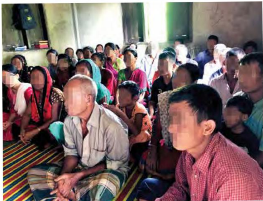
Listening and learning about the true God in a remote and dangerous area