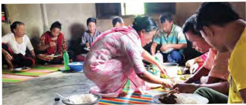
Serving others in her new home provided by Christian Freedom International