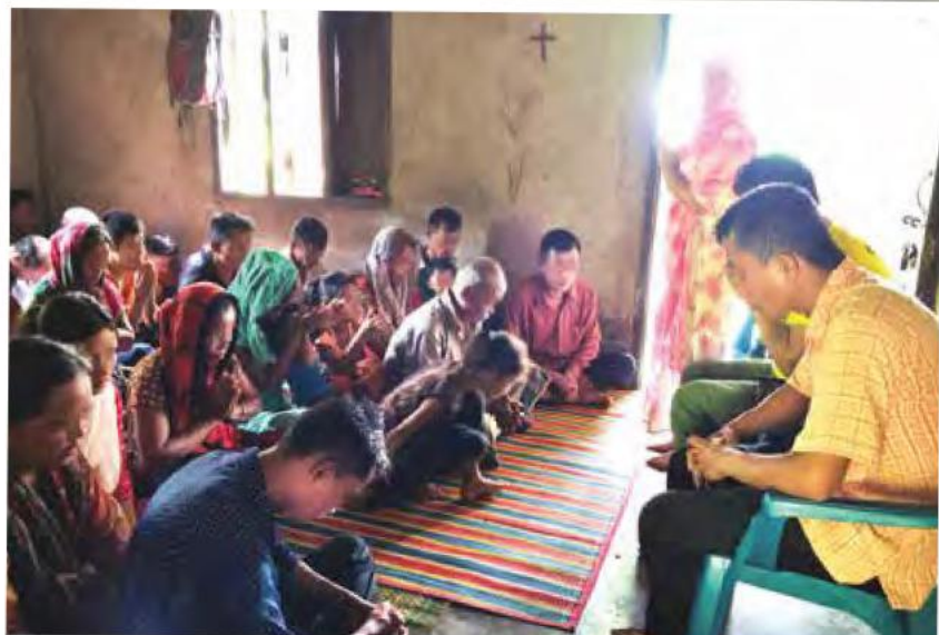
Reny promptly turned her modest home into a Ministry Center.