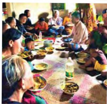
Food and fellowship in Reny's Ministry Center