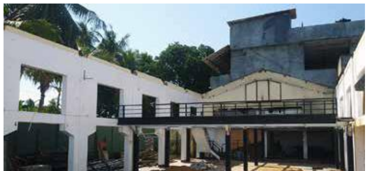
Zion Church in Sri Lanka before and after the Easter bombing in 2019