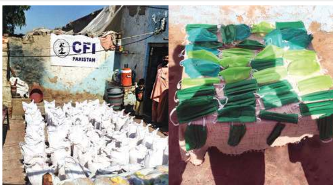
Food and face masks for Christian families in Pakistan brickyards

Globalization – which created the means to spread the virus – also opened windows for us to reach our brothers and sisters who desperately need help. We are using modern online methods and old-fashioned ‘going where others cannot go’ to deliver aid and pray face to face (well, masked face to masked face).