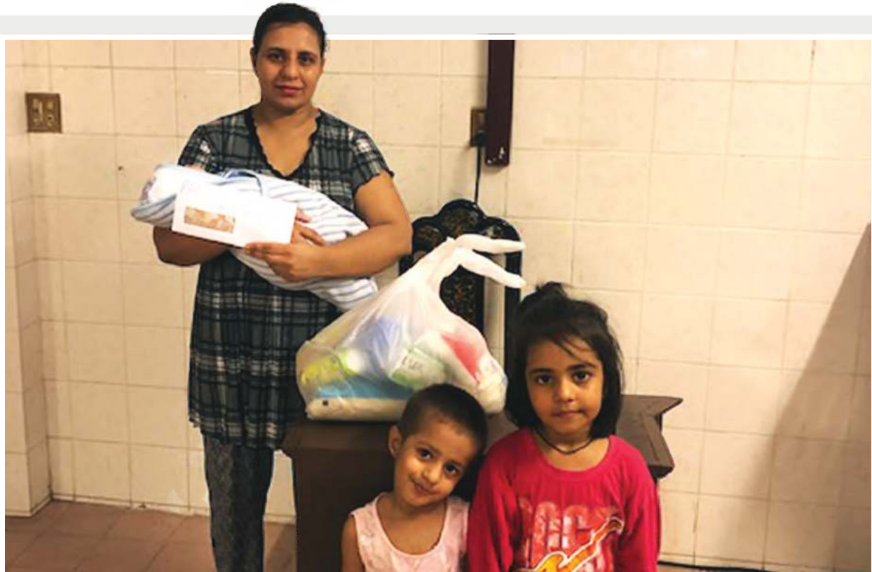
Pakistani Christian refugee families are given food and supplies during the shut-down.

P.S. During this global pandemic, will you pray for persecuted Christians and Christian Freedom International’s teams – for God to act in miraculous ways? Thank you for playing a part during this crisis.