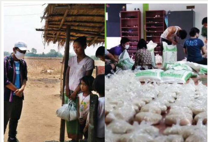
CFI Teachers and students preparing and delivering aid near Burma

CFI's Victory Bible Academy near Burma became a staging ground for preparing 'corona virus care packages'. Teachers and students put their training into action. They trekked to remote villages to hand out rice, sanitizers, masks, water filters, along with messages of how to stay safe and the good news of Jesus Christ.