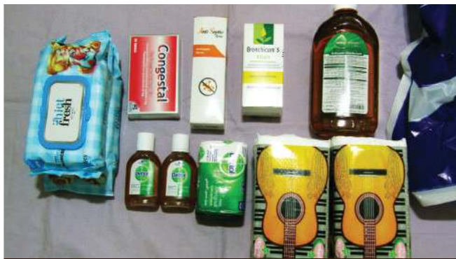
CoronaVirus care package for children in Egypt

In Egypt, Christian children in crowded Garbage City, Cairo, get special packages with soap, anti-septics, medicines, and more. This is in addition to monthly food and essentials from their CFI sponsors.