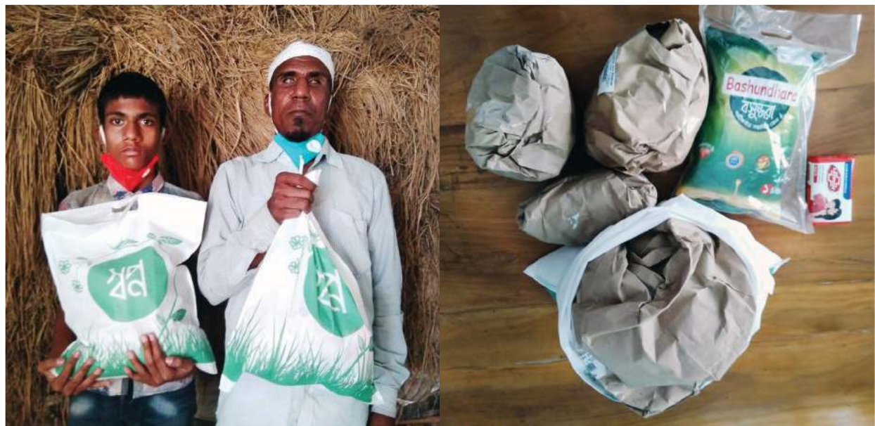
Food, spices and soap for disabled Christian believers

As the gift of the widow in the Holy Gospel was as great to God (Mark 12:41-44, Luke 21:1-4) as your helps are great to God. Finally, thank you brothers and sisters in Christ, and we thank Christian Freedom International. Amen.