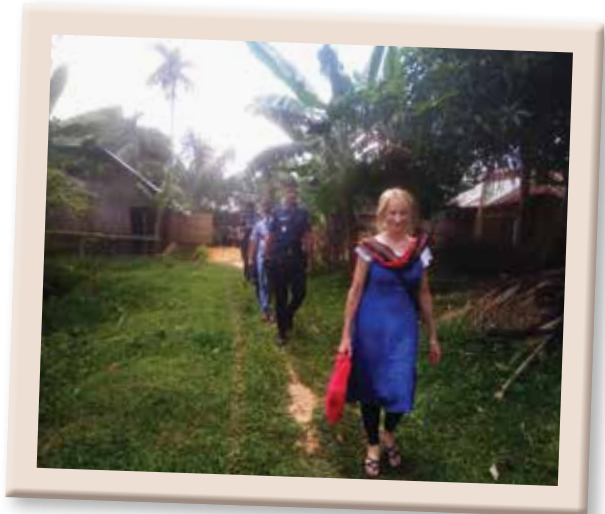
Jungle in Bangladesh with armed police escort