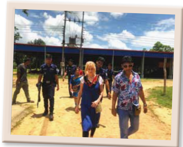
Walking to village with armed police escort