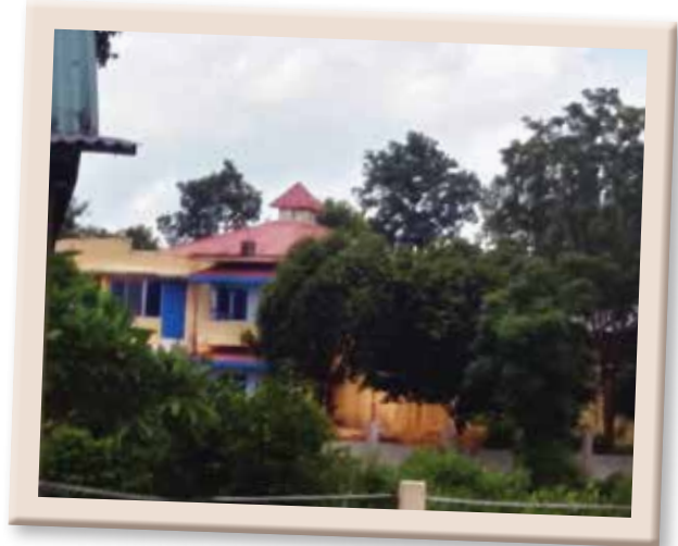
Buddhist Monastery in Bangladesh