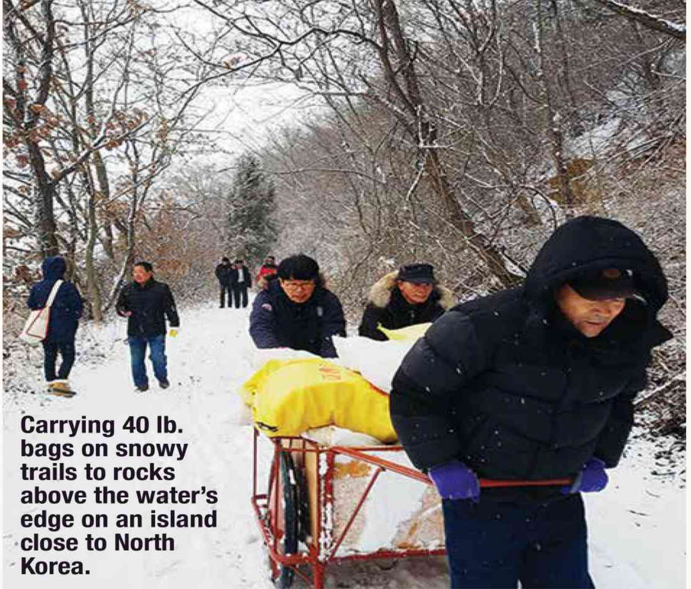
Carrying 40 lb. bags on snowy trails to rocks above the water's edge on an island close to North Korea.