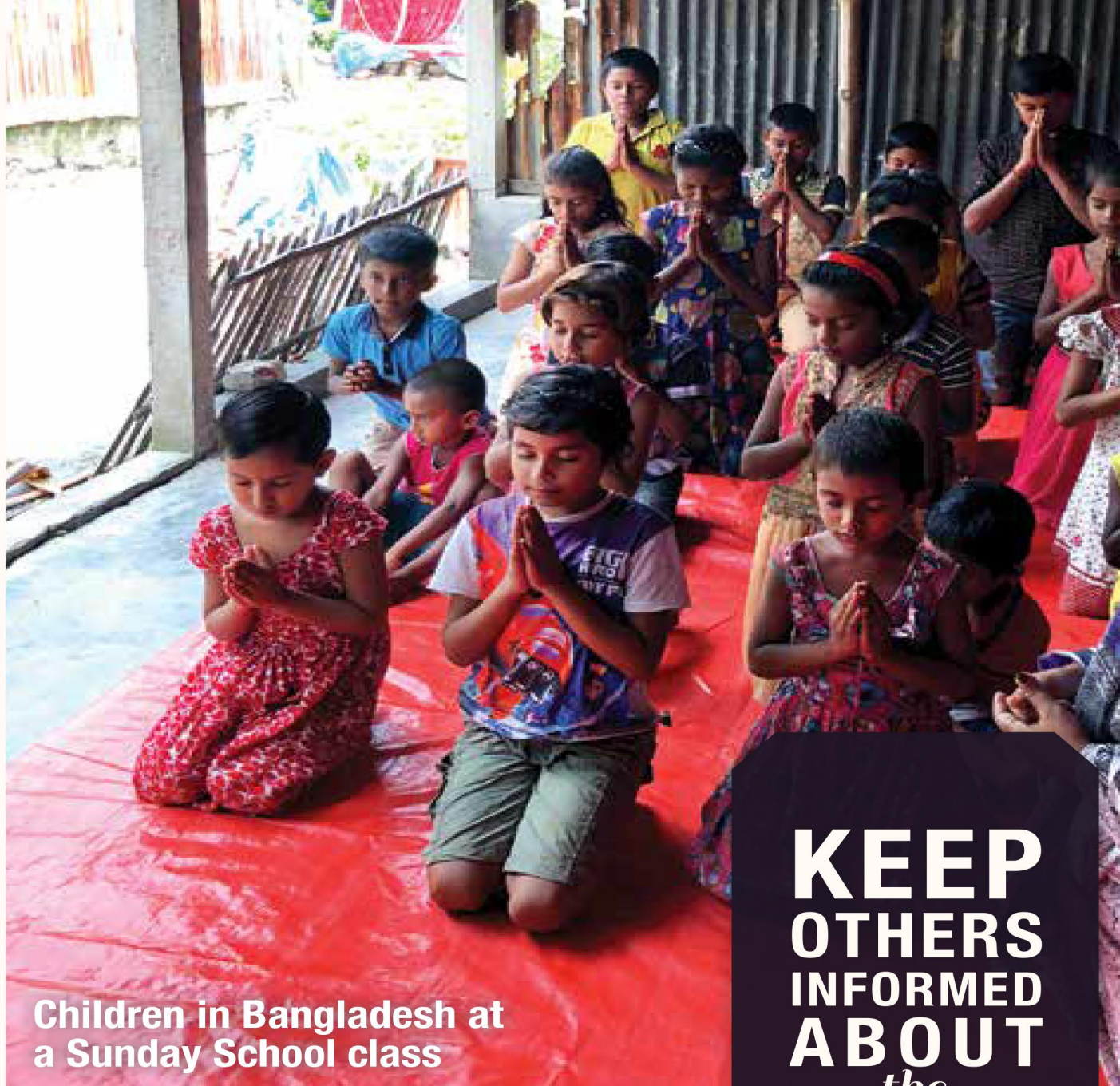
Children in Bangladesh at a Sunday School class

KEEP OTHERS INFORMED ABOUT the PERSECUTED CHURCH