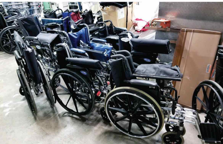
Wheelchairs for Christian refugees in Iraq