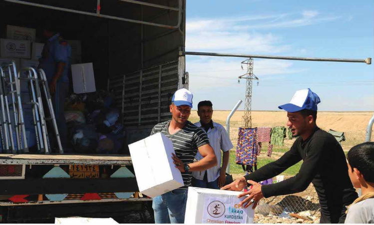
▲ A recent delivery of medical supplies and necessities to Christians in need in Iraq