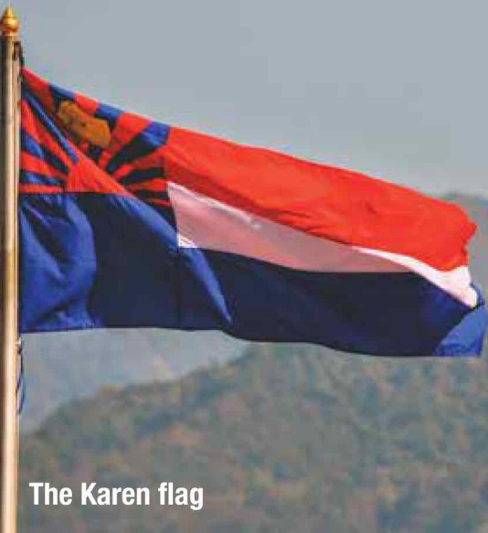
The Karen flag

DESPITE TRIBULATION, DISTRESS, PERSECUTION, FAMINE, DANGER, AND SWORD, "OVERWHELMING VICTORY IS OURS THROUGH CHRIST, WHO LOVED US..."