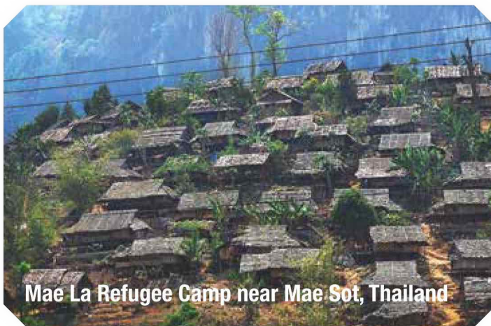
Mae La Refugee Camp near Mae Sot, Thailand