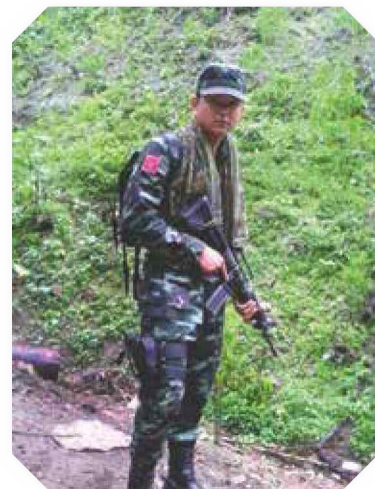
▲ A Karen soldier guards against Burmese Army attacks in Karen State.