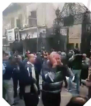
➤ PICTURED IS SOME OF THE AFTERMATH OF THE EXPLOSION OUTSIDE OF ST. MARK'S CATHEDRAL IN ALEXANDRIA

The second suicide bombing occurred in front of St. Mark's Cathedral in Alexandria.