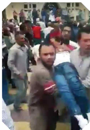
➤ PICTURED IS SOME OF THE AFTERMATH OF THE EXPLOSION OUTSIDE OF ST. GEORGES'S CATHEDRAL IN TANTA

"The metal detector on the main door of the Cathedral