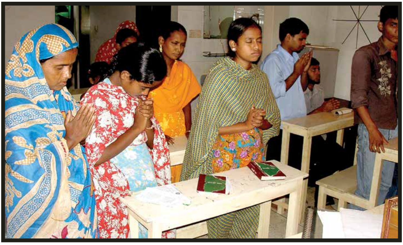
Blind Christians in Bangladesh receive Braille Bibles.