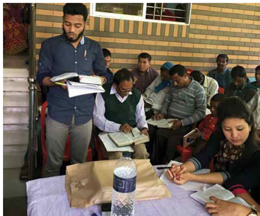
Bibles were given to house church pastors to give to new converts.