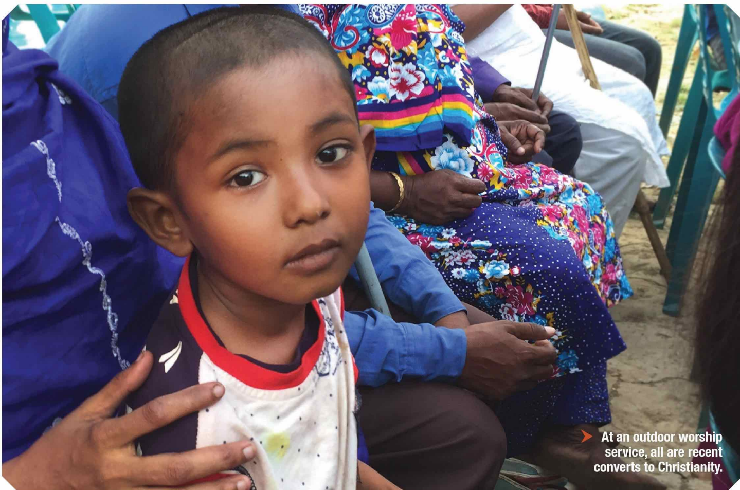
➤ At an outdoor worship service, all are recent converts to Christianity.