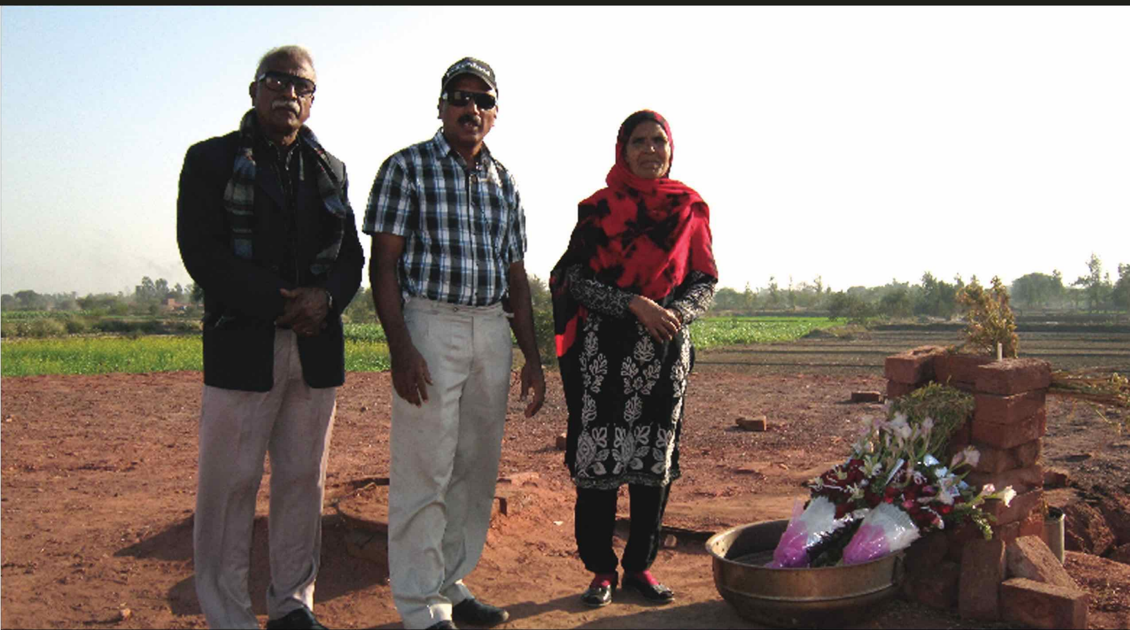
Pictured is one of our co-workers from Pakistan at the brick kiln where the couple was burned to death.