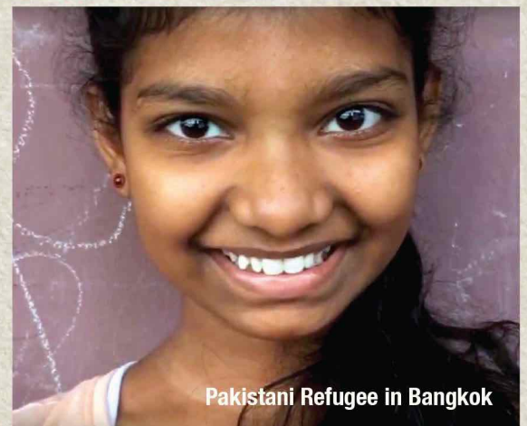
Pakistani Refugee in Bangkok